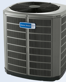
AccuComfort™ Platinum 18