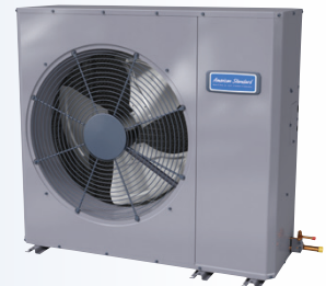
Platinum 19 Low Profile