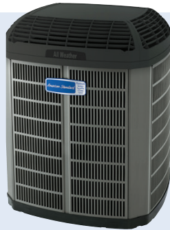
AccuComfort™ Platinum 20

Our most efficient and powerful heat pumps. Enjoy the highest level of comfort and maximum efficiency with features like Duration™ variable speed compressors, Spine Fin™ coils and copper tube coils.*