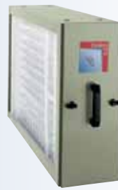
Pleated – TFP