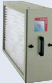
Media – TFM

Take control of the air your family breathes with our Perfect Fit™ Air Cleaner. With innovative features designed to make your home's air feel fresher and cleaner, you and your family can count on consistent, quality comfort year after year.