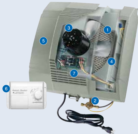
Platinum Whole-Home Humidifier shown. Other models may vary.

Works with the automatic control by monitoring the outdoor temperature and signaling when to add the correct amount of humidity to keep you completely comfortable. (Not shown.)